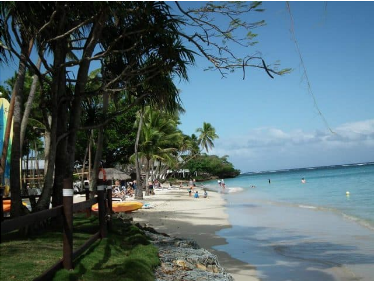
Shangri-La Resort Fiji